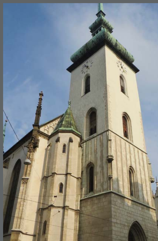
Figure 1 (above): Rehearsing in the Predigerkirche, Basel; Figure 2 (below) St. James' Church, Brno, exterior.

The status of Stadtpfarrkirche meant that all the affairs of the church were overseen by the city council: repairs and building, parish management, and the operation of