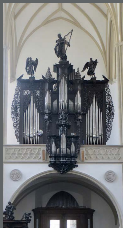
Figure 5: The organ in St James' Church, Brno.